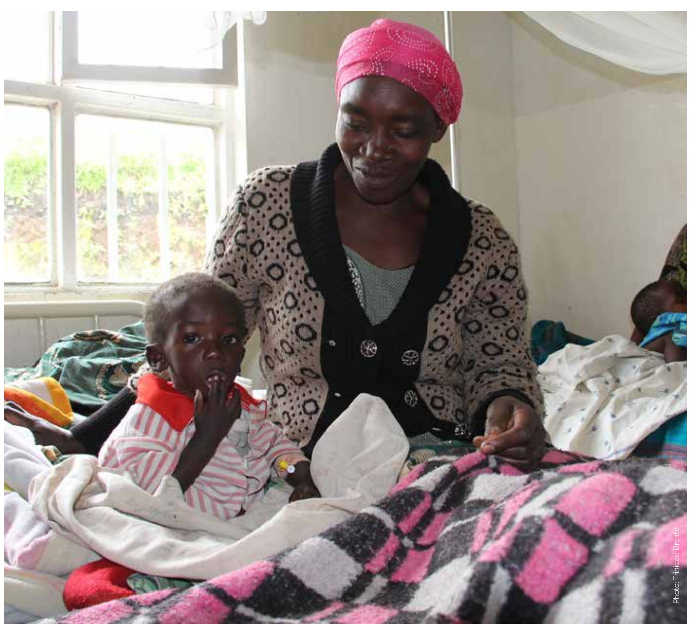
To protect the identity of the protagonists we used fictional names and photos that do not match.

- Mariama, Maiva's mother, hospitalized at one of the health centers involved in the project -